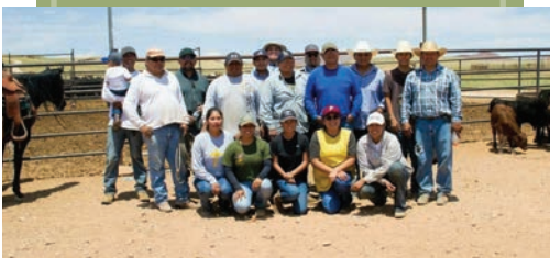
The Nockideneh and Saganitso families